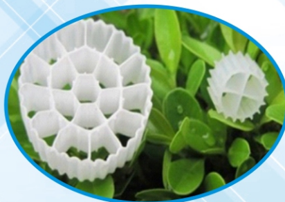
MBBR / FAB Media