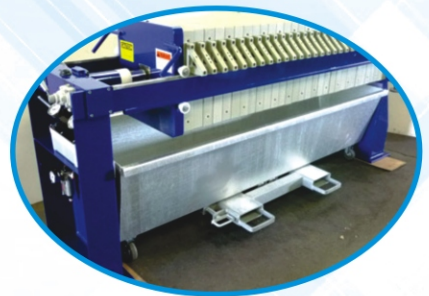
Plate & Frame Filter Press