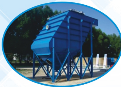
Lamella Clarifiers & Tube Settlers