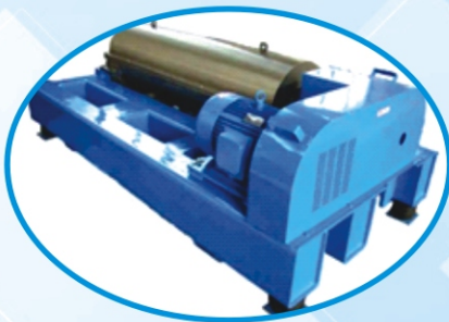
All types of Sludge dewatering centrifuges