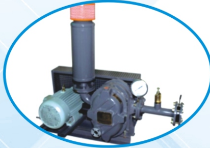
All types of Air Blowers & Compressor System