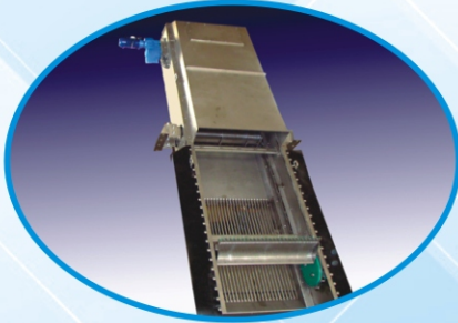
All types of Mechanical & Manual Screening Equipment

Paleo Crystals holds a very experience knowledge in supply of all types of water & wastewater treatment Equipments. Some of them are featured below: